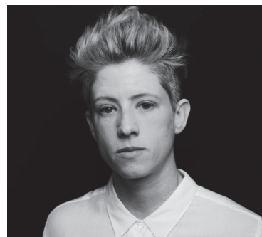
To date, NCLR's #BornPerfect campaign has helped nine states and the District of Columbia pass laws protecting LGBTQ youth from conversion therapy.